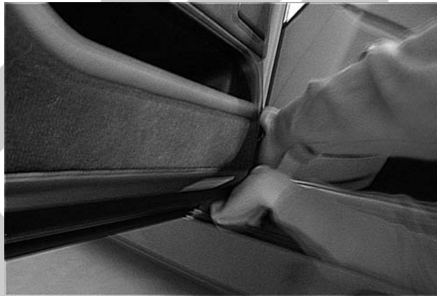
Rear Door Panel shown for reference